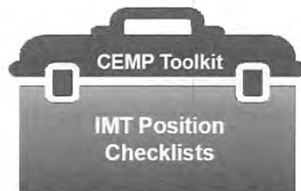
Table 5: Incident Management Team - Facility Position Crosswalk

Table 5 outlines suggested facility positions to fill each of the Incident Management Team positions. The most appropriate individual given the event/incident may fill different roles as needed.